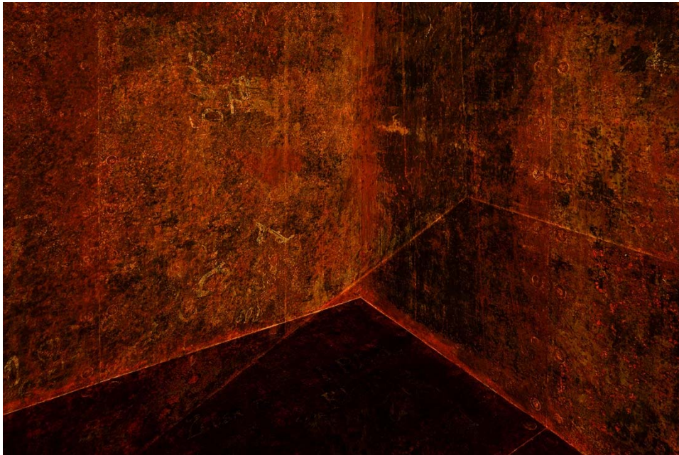
Basement Series II , Hahnemuhle photorag archival paper, 69 x 102cms, framed, 2018