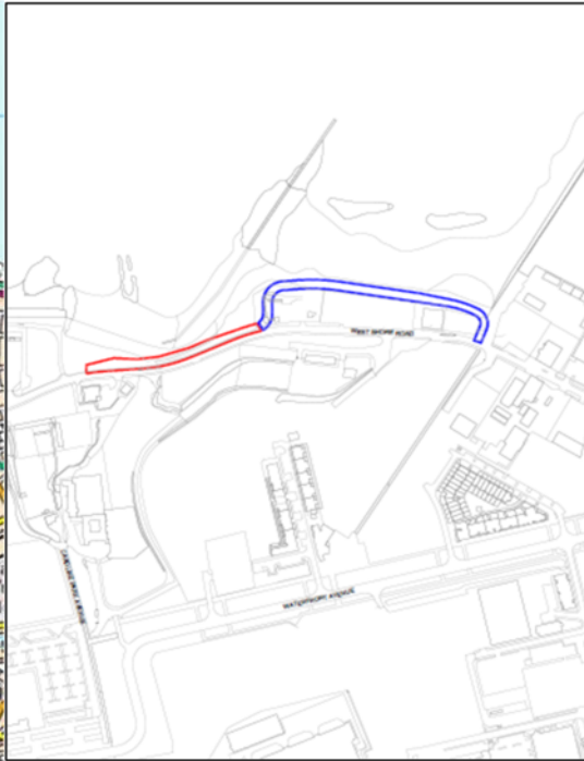
Route option 1