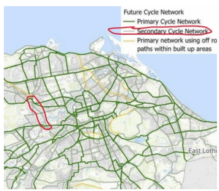
Map from fig 3.3 of the Circulation Plan report, TEC paper 7.2