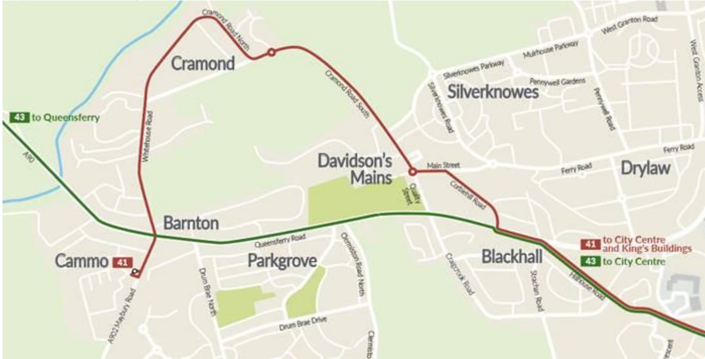
Map showing revised 41 route along with service 43 in the Cammo, Cramond, Parkgrove areas

Revised route and timetable. From Davidson's Mains service 41 operates via Cramond Road South, Barnton Gardens, Cramond Road North, Whitehouse Road, Maybury Road and terminates at the new terminus at Cammo (Meadowsweet Drive).