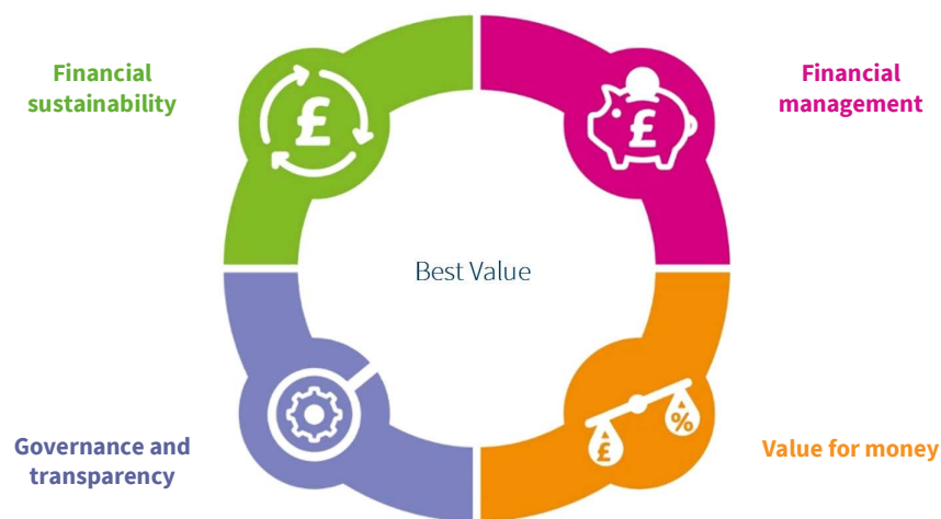
Exhibit 1: Audit dimensions within the Code of Audit Practice