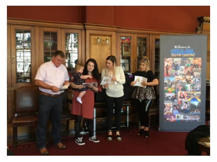
Some of the young mums with staff from the Citadel Youth Centre at the book launch which took place at the City Chambers