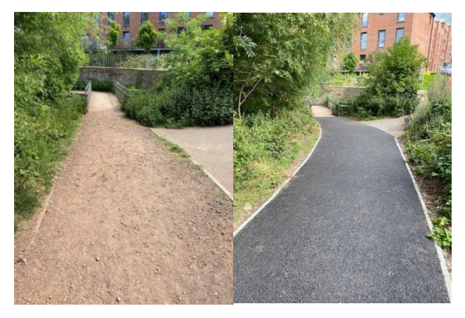
Water of Leith Path Bonnington (before/after)