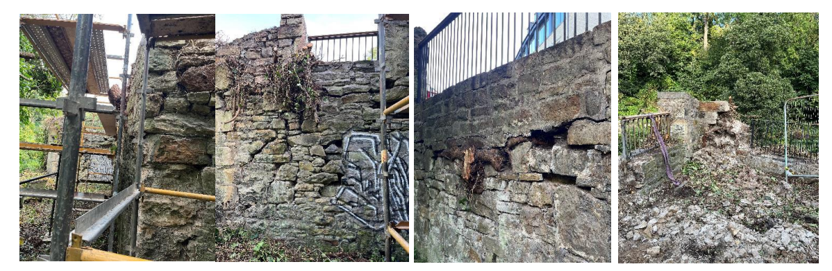
Miller Row Clearance and Issues (during)