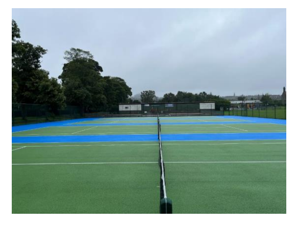
Inverleith Park Tennis Courts (after)