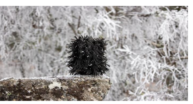
Naomi Mcintosh, 'Lost Song (Cuckoo)', 2021. © the artist.

Usher Hall, Assembly Rooms and Churchill Theatre upcoming events (Wards Affected: All)