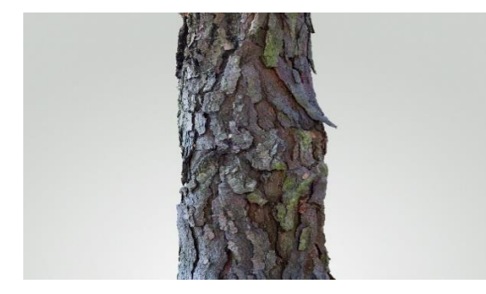
Dalziel + Scullion, 'Unknown Pines (Digger)', 2007. \textcircled{\sc op} the artist

The exhibition is accompanied by an exciting events programme. For further information please visit edinburghmseums.org.uk