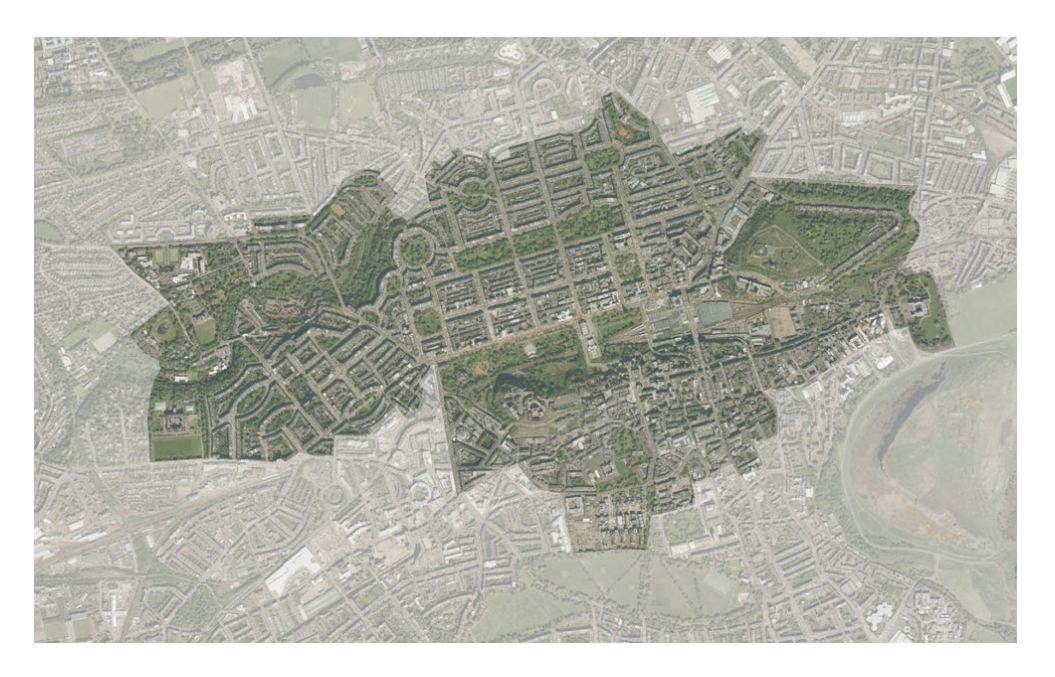
Figure 1: Map of the World Heritage Site boundary

The Old and New Towns are located in the centre of Edinburgh, which sits on the southern shore of the Firth of Forth. Edinburgh is Scotland's capital and second most populous city.