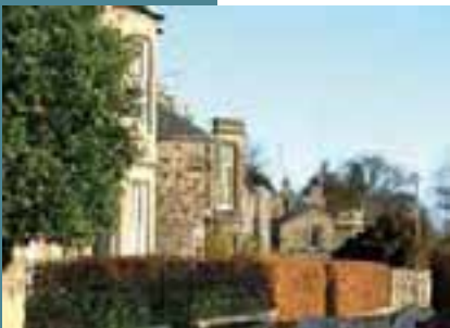
Old Church Lane

of amalgamation. In the middle section of the village, the plot sizes show least variation though there is a quite different character to development facing on to each of the two streets. On Old Church Lane are detached Georgian villas, set back from the road edge with front gardens that take advantage of their south facing aspect. In contrast development at the west end of The Causeway, the original route through the village, is more modest, terraced and set right at the heel of the pavement echoing more accurately the traditional vernacular of Scottish village architecture. On the south side of the street, three properties following the Sheep Heid Inn still retain a continuous frontage but are set back behind short front gardens before a high stone wall then continues on both sides to the end of the street. Detached houses are set behind these stone walls.