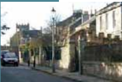
Old Church Lane