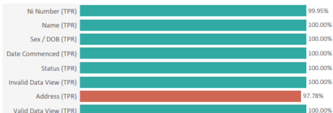
TPR Pass Rate % by Test Category

The score for the Address category is the only category not to achieve 99% or above. The following table shows the breakdown of the number of records that failed this category’s tests.