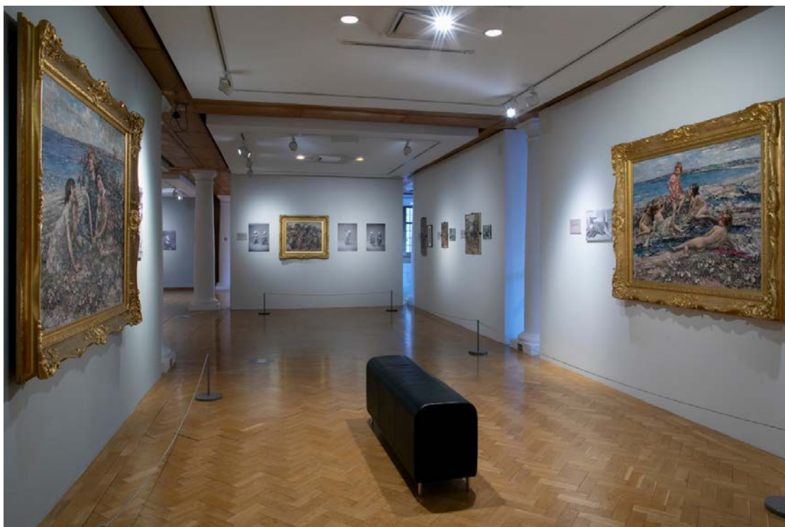
E.A.Hornel: From Camera to Canvas.

The recently opened E.A.Hornel: From Camera to Canvas exhibition at the City Art Centre is the first major exhibition of Hornel's work for 35 years, and it sets out to demonstrate how photography underpinned his work. Organised in partnership with the National Trust for Scotland, the exhibition draws on the huge photographic collection of c1,700 images that Hornel used to create his paintings. Hornel was one of the leading members of the Glasgow School of painters. However, it was his first visit to Japan in the early 1890s in the company of artist friend George Henry that led to a change in artistic direction.