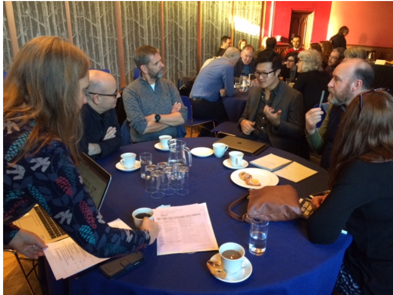
Heads of Creative Learning Forum discussion groups

developing a Creative Learning Strategy for the City. The third meeting was cancelled as it was scheduled for April 2020 in lockdown. With the disruption to schools and the unique disruption and uncertainty for Arts Organisations, the third meeting has not yet been re-scheduled. Time was needed to see what recovery for the arts and creative sector might look like. The next meeting will take place on-line in early 2021.