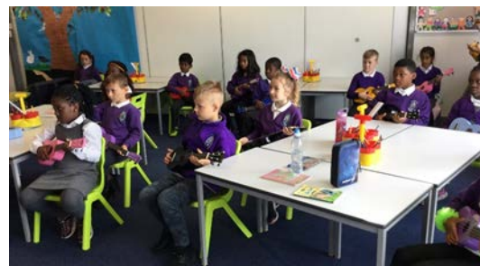
St Joseph's RC Primary School enjoying the YMI's Sounds Like Music programme prior to lockdown