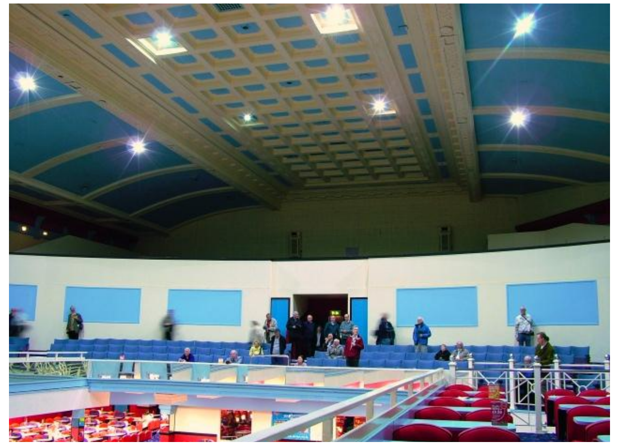
Inside the Bingo Hall - View 3