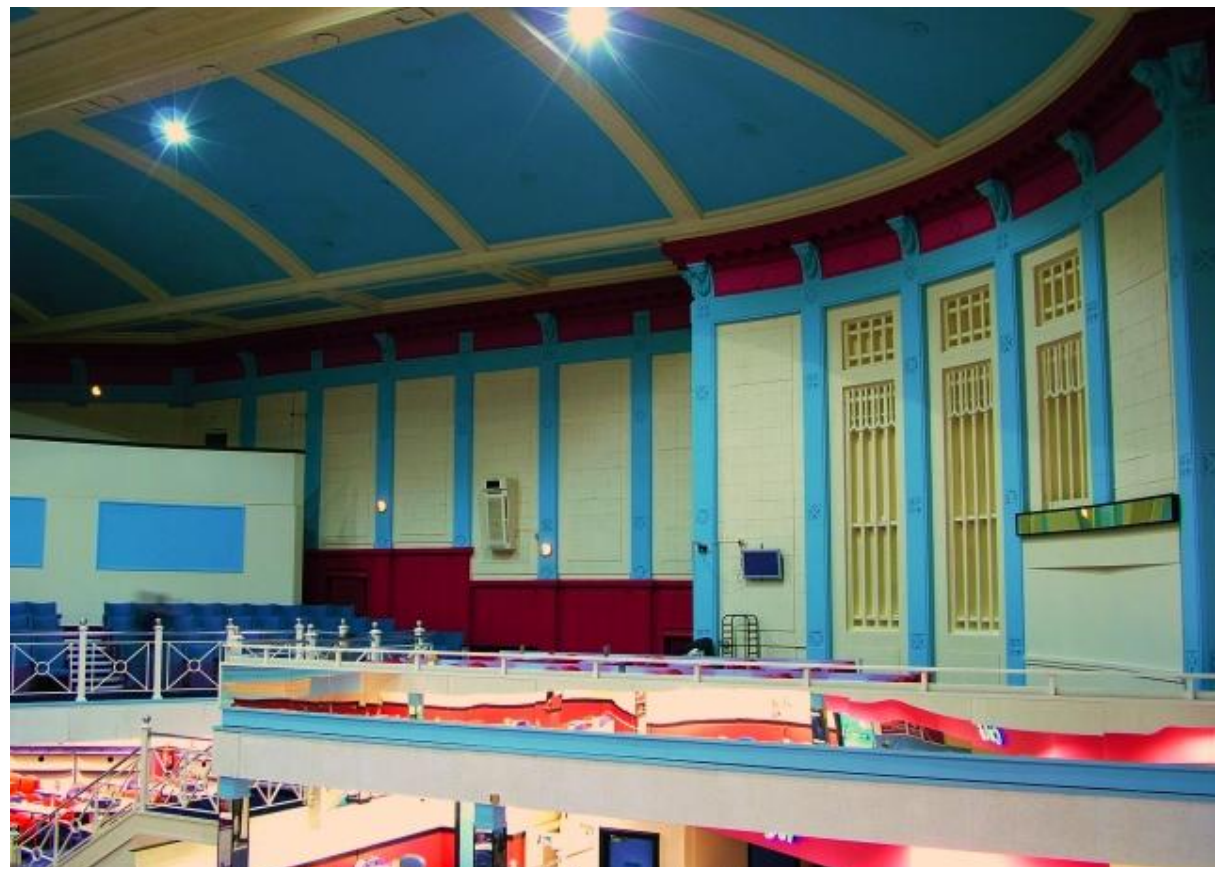
Inside the Bingo Hall - View 2