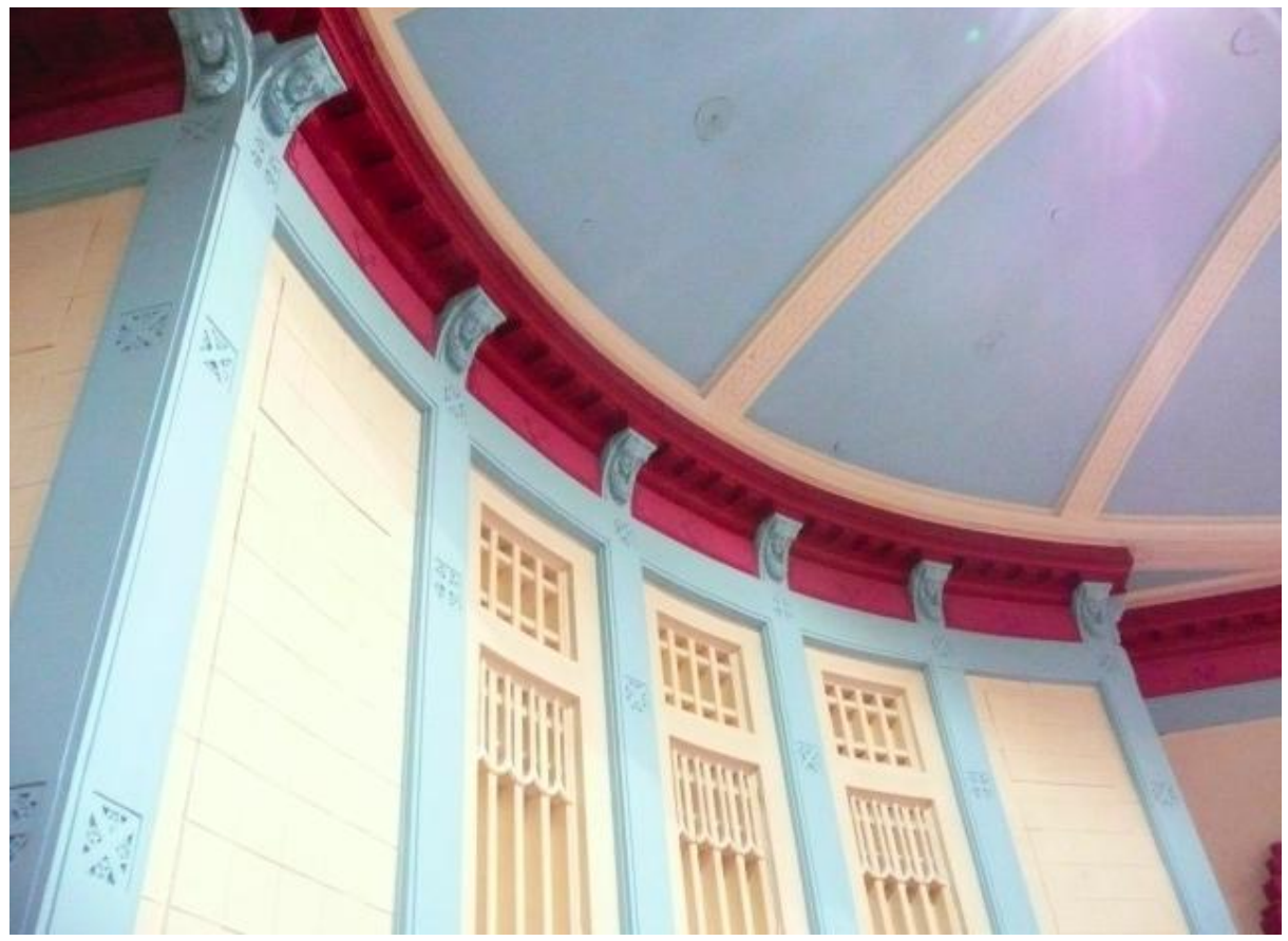
Inside the Bingo Hall - View 4