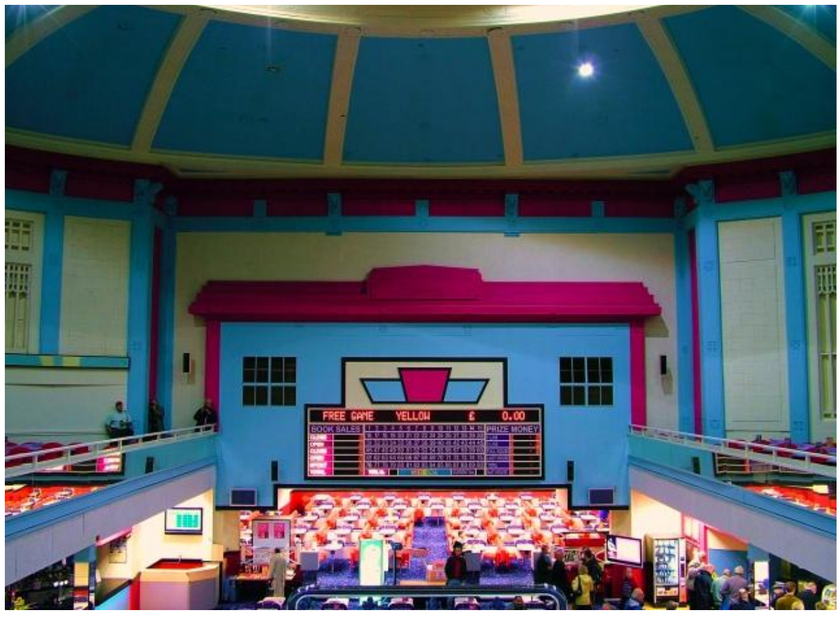
Inside the Bingo Hall - View 1