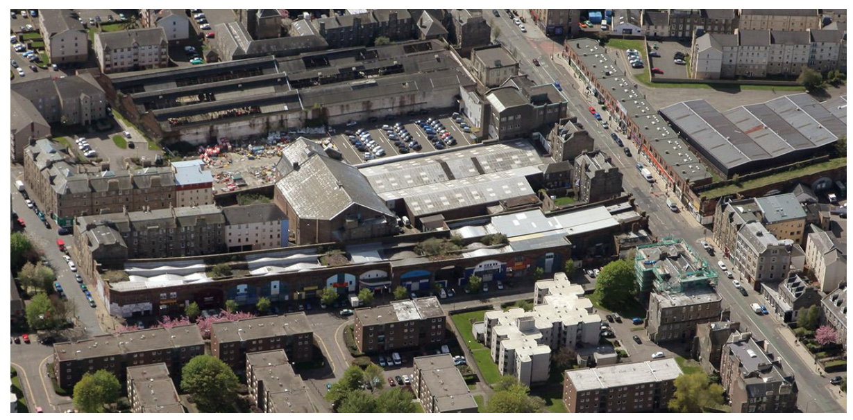
Aerial view of the arches on Manderston Street with the Bingo Hall (centre)