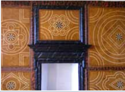
Law's Close, Kirkcaldy, Fife. A 17th-century painted, grained and marbled geometrical pattern was reinstated in 2005 on the basis of patterns found beneath layers of paint and a shelf. The original evidence was retained beneath thin plywood for future study.