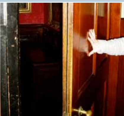
Intumescent strip added to the edge of a historic door. When heated the strip expands to seal the gap between the door and the frame, reducing the supply of oxygen to a fire. Intumescent paint or varnish can also enhance the fire resistance of historic doors.

and a 'private' parlour, would be uncharacteristic of the traditional arrangement. A new opening in such a location should be carefully designed to minimise disruption to the characters of the spaces being linked. Solid doors are likely to best retain the sense of enclosure in these cases, rather than glazed doors or openings without doors.