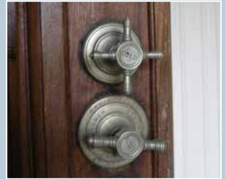
Late 19th-century taps, forming some of the fixtures of a house in the Scottish Borders.

Where listed building consent is required, an application is made to the local authority. This should include accurate scale drawings showing both the existing situation and proposed works in context. It is normally helpful to provide detailed technical information and photographs.