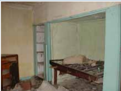
A built-in box bed in a cottage at Bridge of Brown, Highland. The interiors of vernacular buildings can contain features that were once commonplace, but are now rare.

to its function. For example, the size and arrangement of a 'public' room, such as a dining or drawing room, often contrasts with less formal or elaborate 'private' spaces, such as bedrooms and parlours. Windows, doors and fireplaces within rooms were frequently designed and located to complement these proportions.