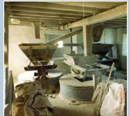
New Barony Mill, Boardhouse, Orkney. The survival of the machinery in this meal mill of 1873 allows an understanding of why the building was designed and laid out in the way that it is and how the building functioned. Corn or meal mill machinery is usually located in a small area at the end of the building nearest the power source, and can frequently be kept as a feature of mills converted for other use.