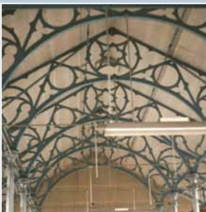
Taybank Works, Dundee, a former jute spinning mill of 1873. The structural cast-iron frame was retained in situ when reversible sound- and fire-proofed partitions were inserted on conversion to residential use.