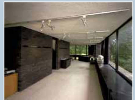
RCAHMS record photograph of a textile studio (1972) before recent residential conversion.