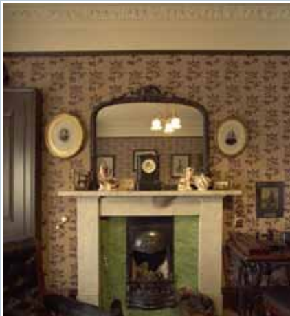
A typical 'best room' or parlour fireplace in a late 19th-century tenement. In this case the fixtures are likely to include the fireplace and shelf, the cast-iron grate and hood, the decorative tiled panels flanking the grate and the floor tiles.