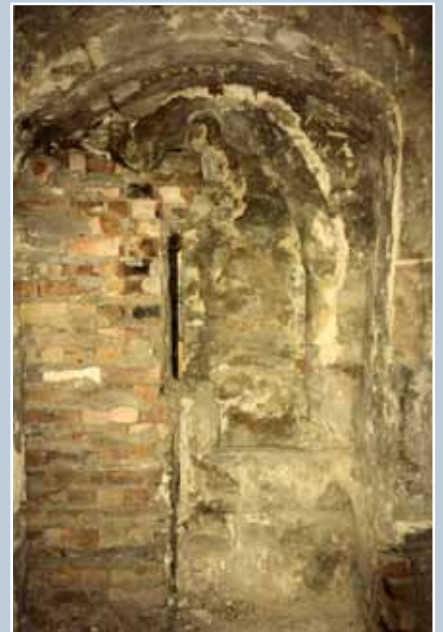
Abbot's House, Dunfermline, Fife. Refurbishment of the building provided an opportunity to reveal and record archaeological evidence of the building's development. Evidence of an earlier structure, possibly dating from the 1460s, was discovered. This blocked plate-traceried window is now conserved and displayed to visitors.