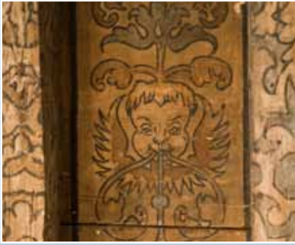
17th-century painted timber ceiling, Edinburgh. Colourful decoration painted directly onto ceiling boards and beams was commonplace in merchant and noble houses in the 16th and 17th centuries. Many painted ceilings depicted narrative, allegorical or emblematic subjects appropriate to the patron, but they were often covered over at a later date by new owners.