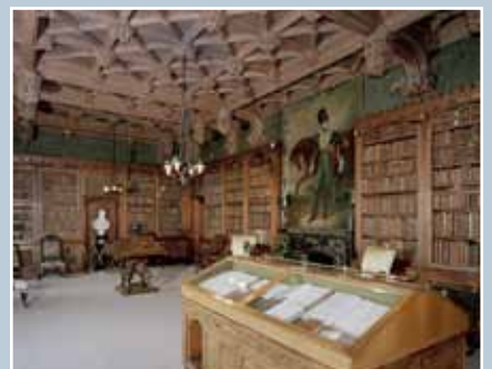
The Library, Abbotsford, Scottish Borders. Apart from containing the book collection that helped to shape the imagination of Sir Walter Scott, the decoration of the little-altered room reveals the famous writer's antiquarian taste in architecture and furniture.