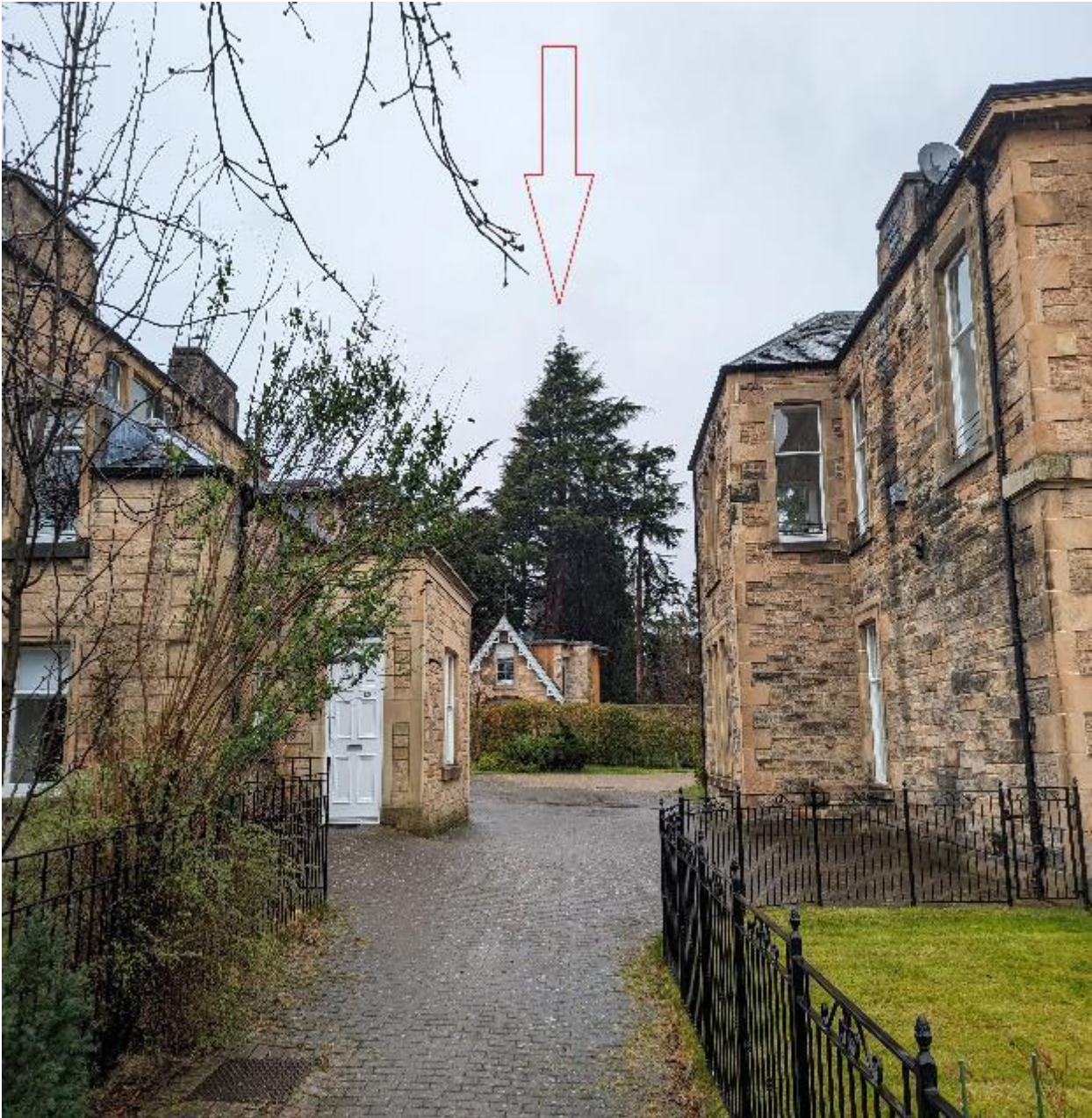
Fig 1. View of trees from St Albans Road.